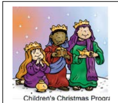
Children's Christmas Proors

December 11 – 6:30pm Come, enjoy “The Case of the Missing Meaning.” Bring your family and friends.